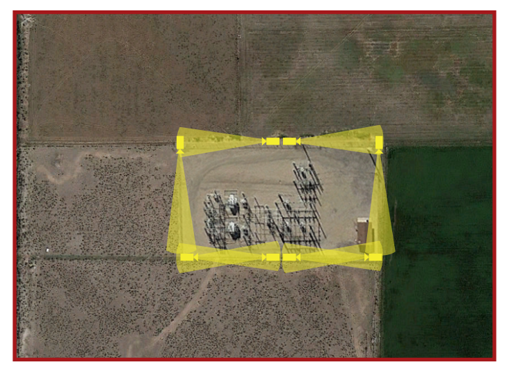
Perimeter coverage with cameras only